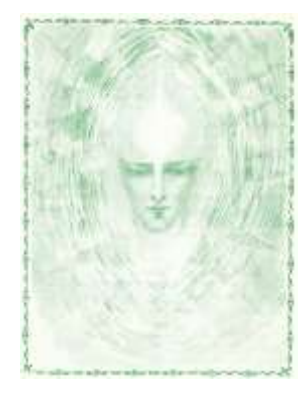
Master Hilarion showing Himself in Deva form