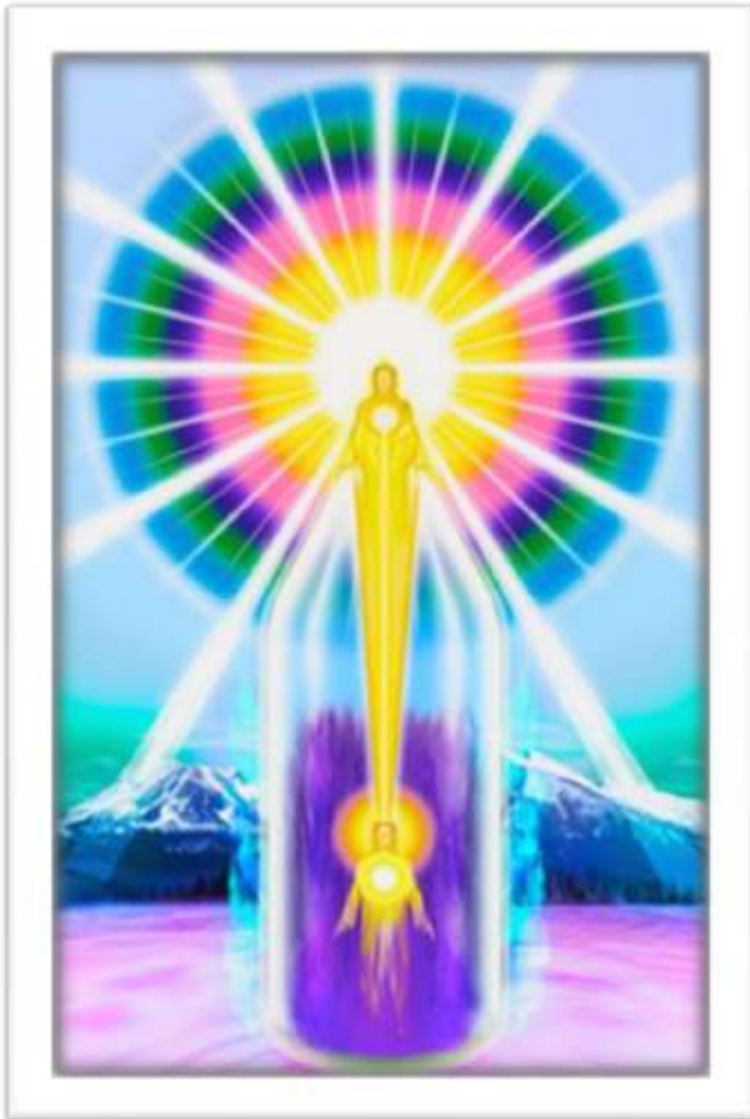
THE MAGIC "I AM" PRESENCE!