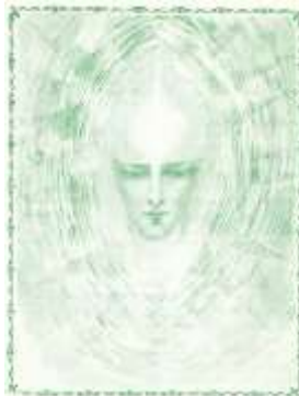
Master Hilarion showing Himself in Deva form